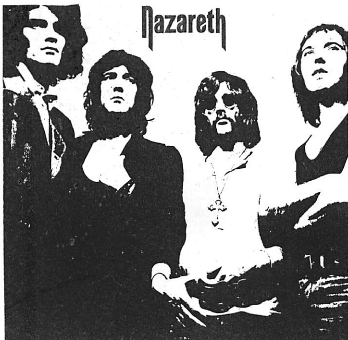
Left: The eponymous debut.