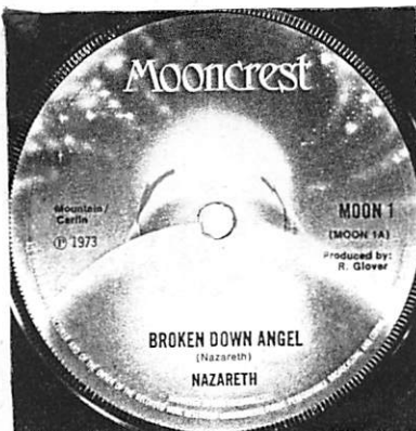
Left: Broken Down Angel and Shanghai'd In Shanghai both had slightly darker and bluer labels than the other Mooncrest singles.