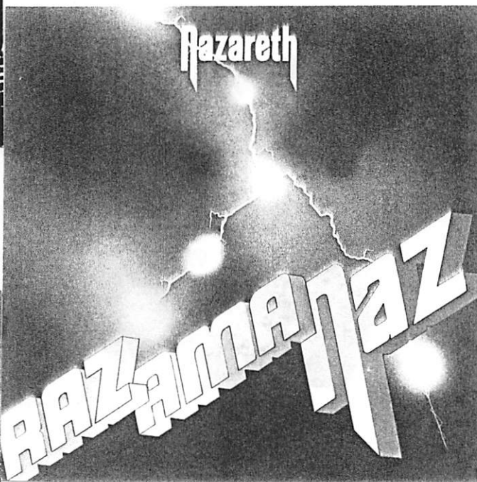
Right: The standard setting Razamanaz LP.