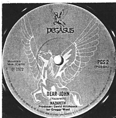
Left: The first Nazareth single, Dear John, came on a distinctive blue label. It's now very hard to find.