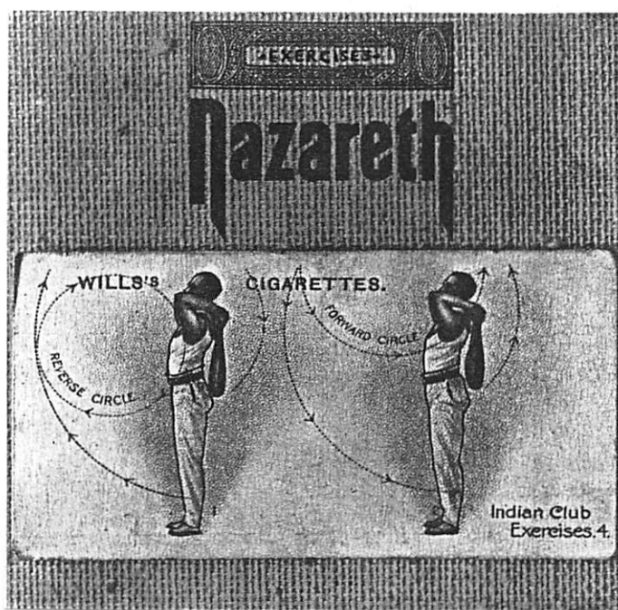
Left: Nazareth's 2nd LP, Exercises.