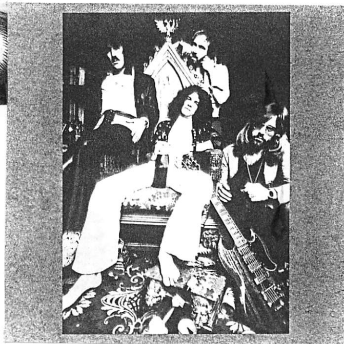
Right: From the gatefold of the Loud 'N' Proud LP.