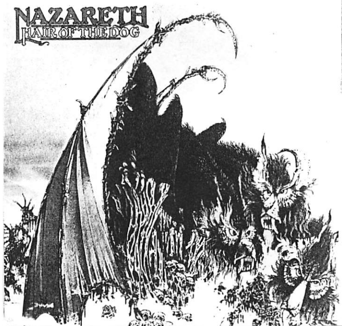
Left: The cover of the classic Hair Of The Dog LP.